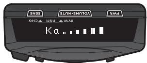
◀ Inverted Orientation

In this setting, the detector can be mounted upside down and all information will be inverted so it's readable.