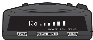
◀ Standard Orientation

In this setting, the display will provide all information in its normal orientation.